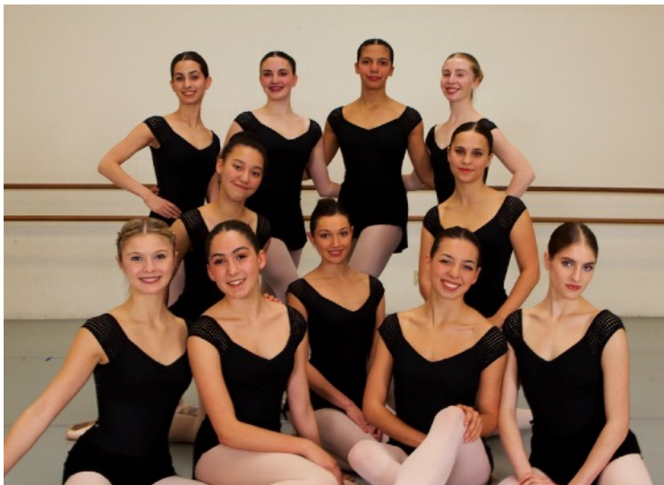
The talented dancers of the SCBT Senior Company