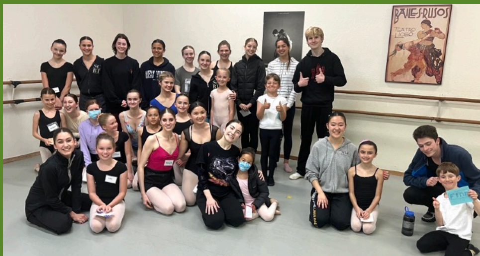
Big Buddies and Little Buddies meet for the first time and encourage each other for The Jungle Book weekend. SCBT will plan a few informal events through the spring so the dancers can bond and the Senior Company dancers can mentor their Petite Company counterparts. We're all on the same team!

Tickets will go on sale mid-March at the Crocker/VAPA Tickets website. Go to our Tickets page for information and direct line to tickets.