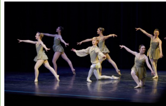
SCBT in performance with the Santa Cruz Symphony last month.