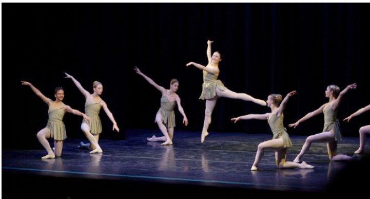
Senior Company dancers in performance with the Santa Cruz Symphony last month.

The Studio presents its own high-quality training options throughout the summer. Serious students are encouraged to study as much as possible to build strength and technique. Fall placements are assigned mid-summer and are based on what we see through the summer. Otherwise, we refer to the student's ability the last time they were in the studio.