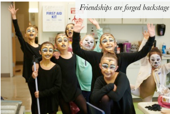
Friendships are forged backstage