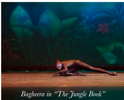
Bagheera in "The Jungle Book"

Private flexibility sessions are available by appointment only; contact Diane directly to schedule.