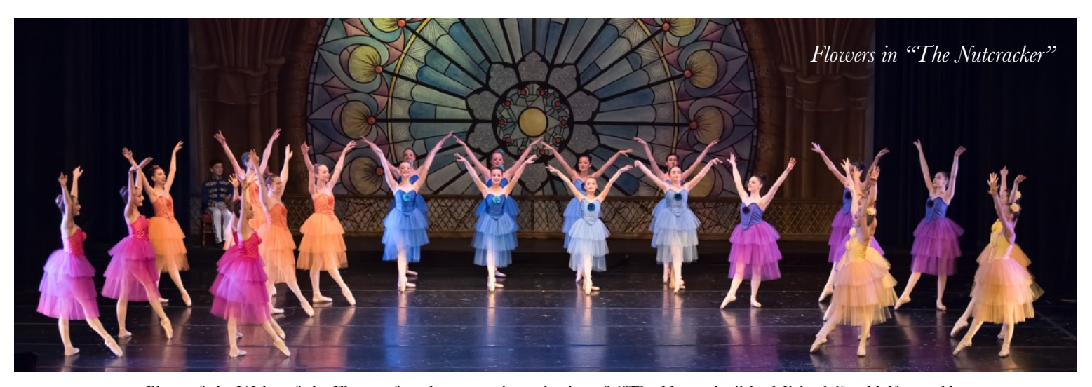
Photo of the Waltz of the Flowers from last season's production of "The Nutcracker" ; note the beautiful new costumes acquired last year which were constructed by San Jose Art Institute masters students.