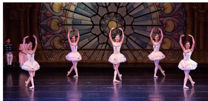
Photo of the Marzipan divertissement