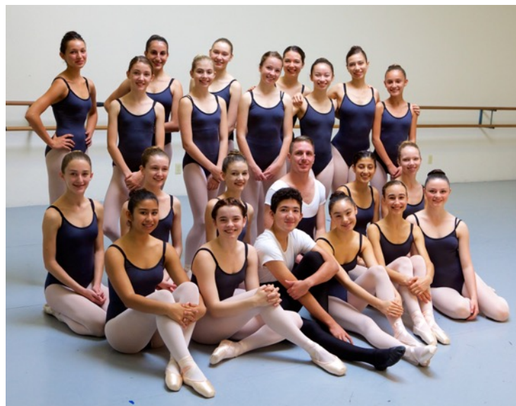
Our Senior Company dancers ready to take on 2017!

More information will be distributed in our Summer Brochure.