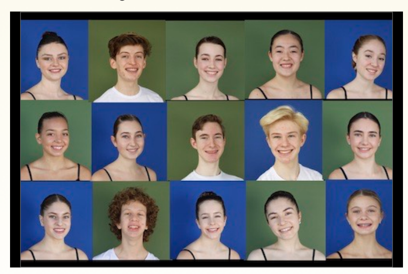
Camaraderie is key!

Adult Classes are taught with the same knowledge as our Professional Program and with the building blocks to ensure safe and rewarding results.