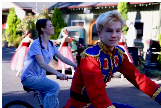
Clara and the Nutcracker Prince ride bikes provided by Epicenter Cycling The Arabian princess filmed by Action Studios on the patio at the Museum of Art and History.