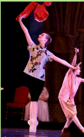
Perle demonstrates a beautifully executed