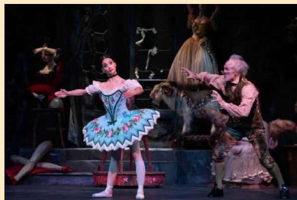
Coppelia , right: Swanhilda masquerades as a doll in Dr. Coppelius' workshop

Which ballet is the answer to these questions?