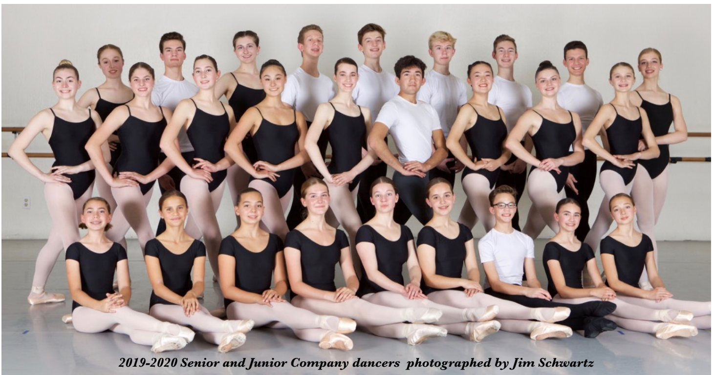
2019-2020 Senior and Junior Company dancers