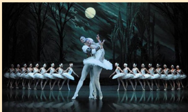
Swan Lake , left: Prince Sigfried and Odette, the Queen of the Swans