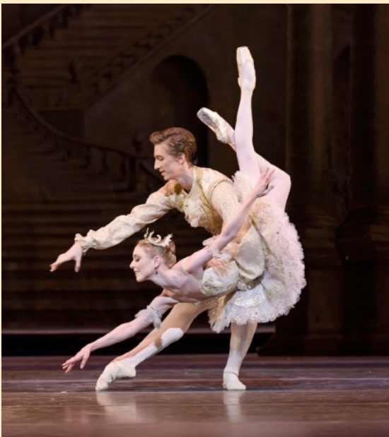
Scenes from The Sleeping Beauty

Left, Princess Aurora and Prince Desirée in the Act III grand pas de deux.