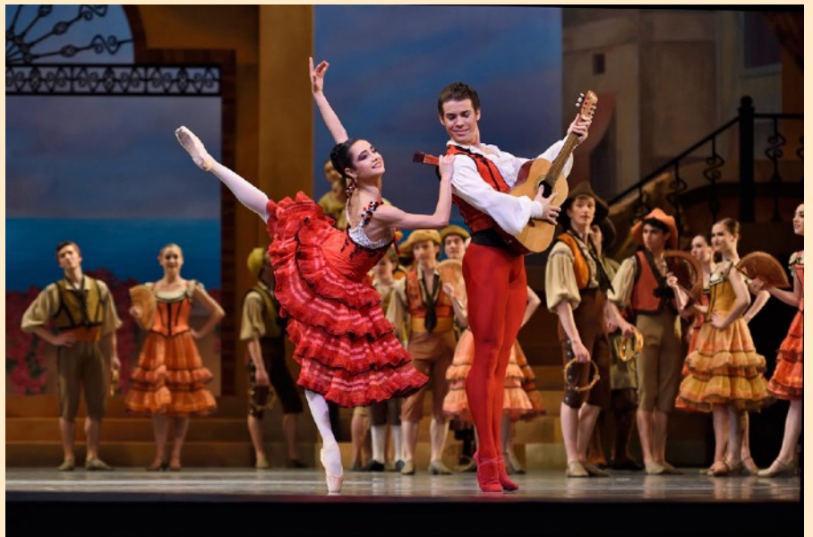
Right: the leading characters Kitri and Basilio in Don Quixote Act I