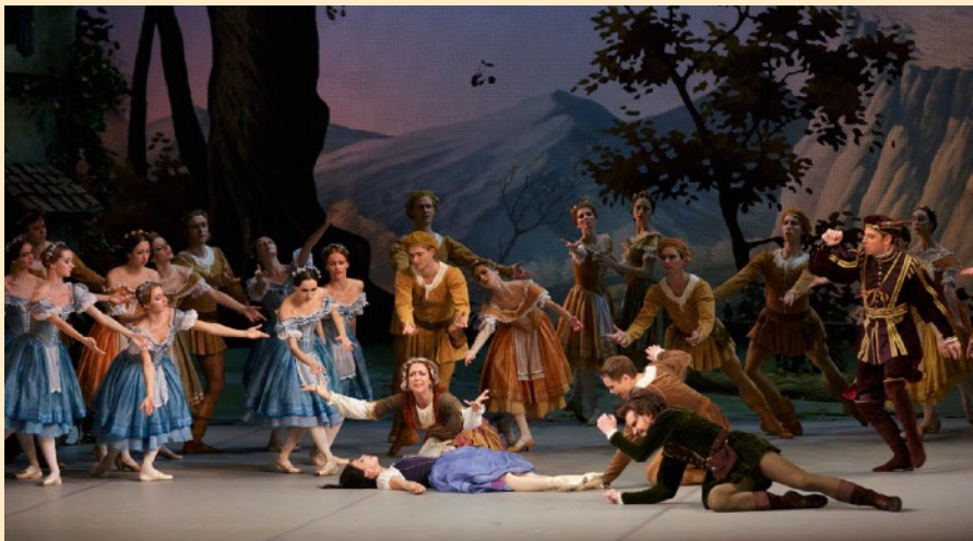
Scenes from Giselle