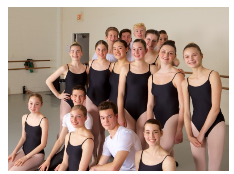
Senior Company dancers display the camaraderie built over months of working hard together and supporting each other's efforts.