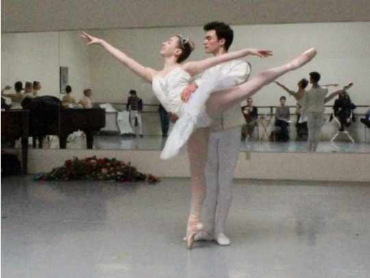
Act II divertissements, Dolls, Snow Pas de Deux couple, Waltz of the Flowers lead, The Boys chill in the dressing room