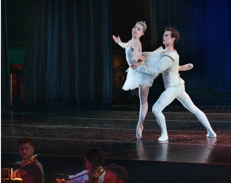
The Nutcracker performances