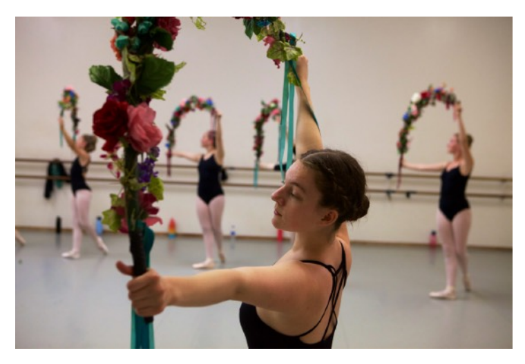
DURING THE HARD WORK AND BETWEEN REHEARSALS OUR DANCERS ARE FORGING