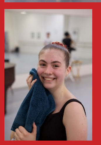
Our New Waltz of the Flowers Choreographed especially for our dancers by the incomparable RON CUNNINGHAM promises to be a special treat in this year's production of