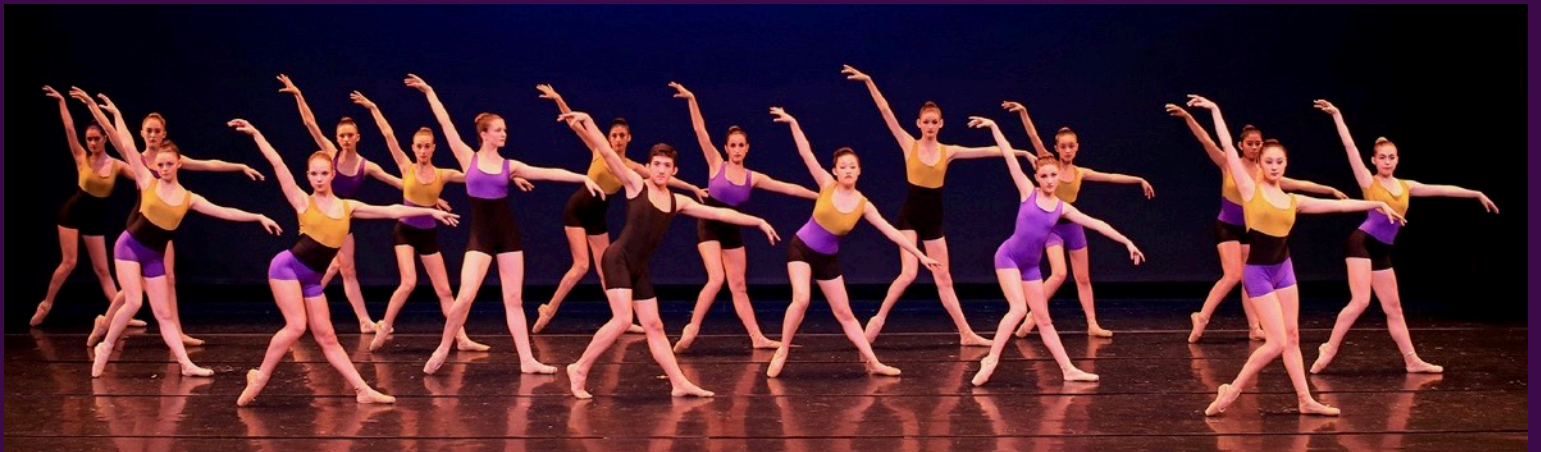
Senior Company dancers in "Swan Lake Act II," "Gaelicia" and "Pivot."